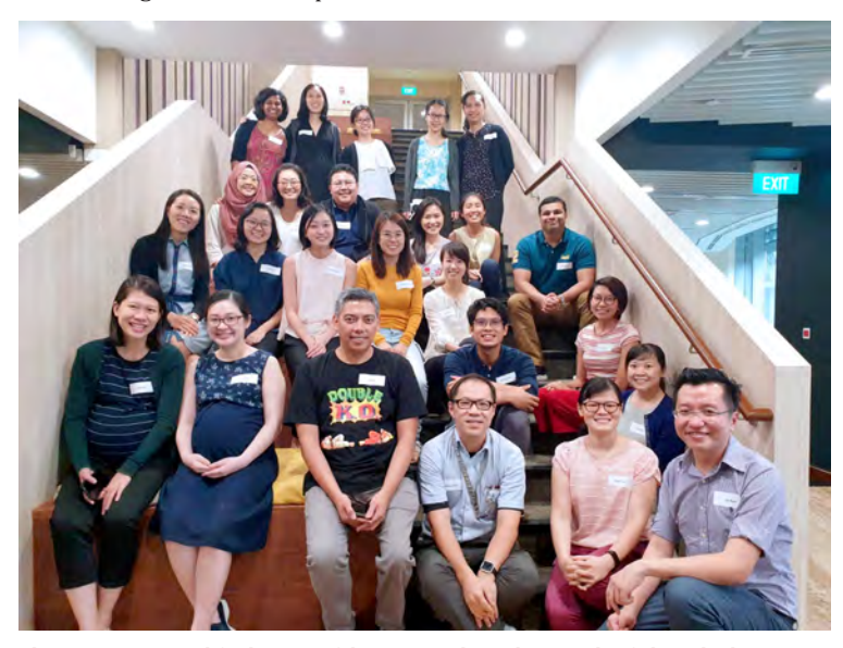
The participants and facilitators of the inaugural Coaching Tools of Clinical Educators programme.

"Now that I am cognisant of the coaching tools, I would use GROW to guide me during my moments of coaching," said one of the participants. "I am now confident to take on different roles as an educator."