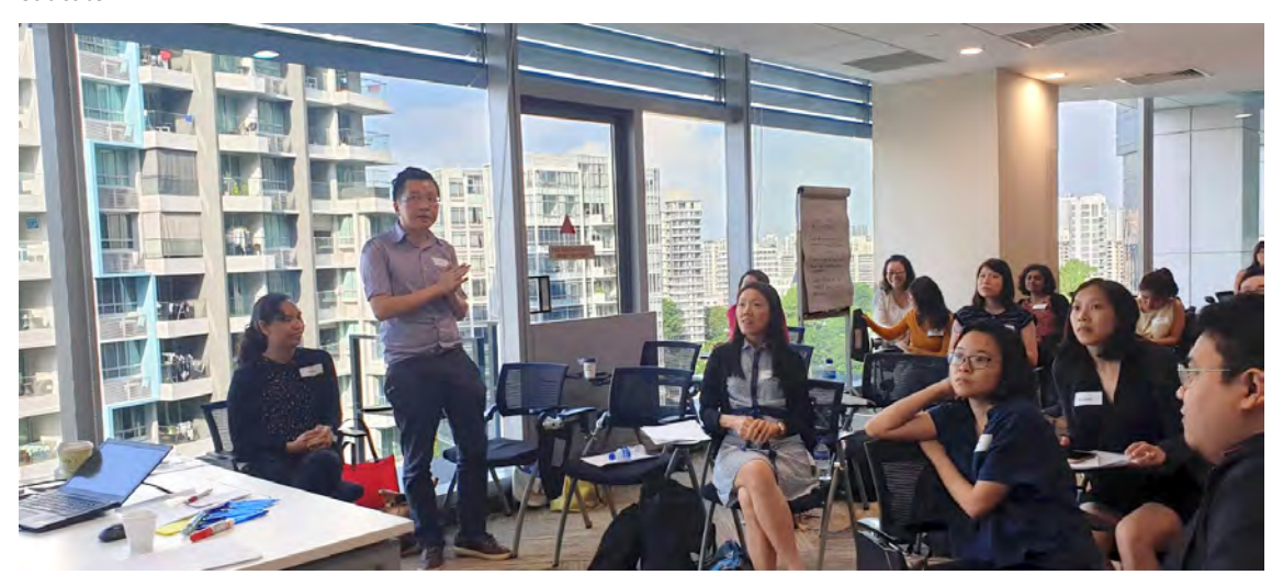
Participant presenting a segment of the GROW conversation model